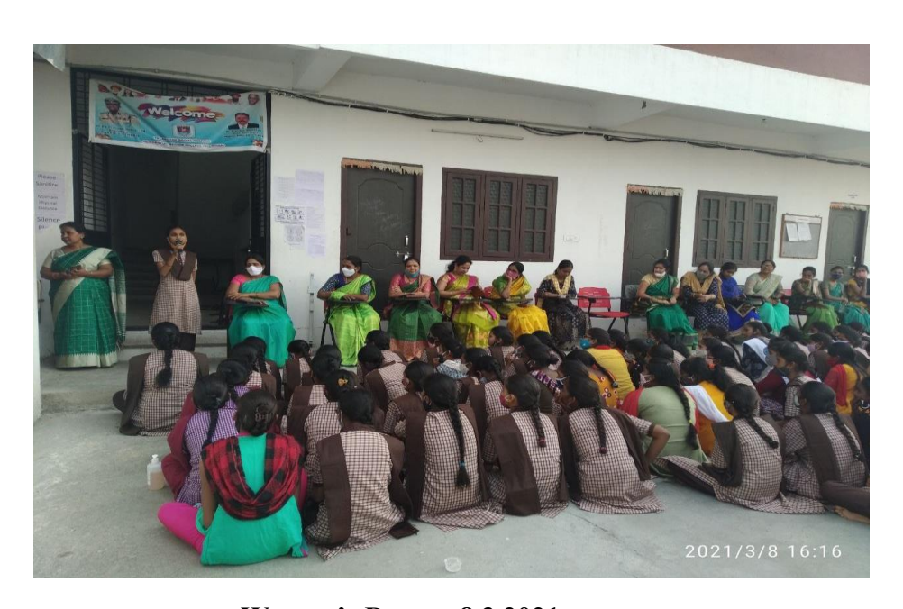
Women's Day on 8.3.2021

At the end of the programme our respected Principal sir delivered a speech on importance and greatness of this day. 60 members participated.