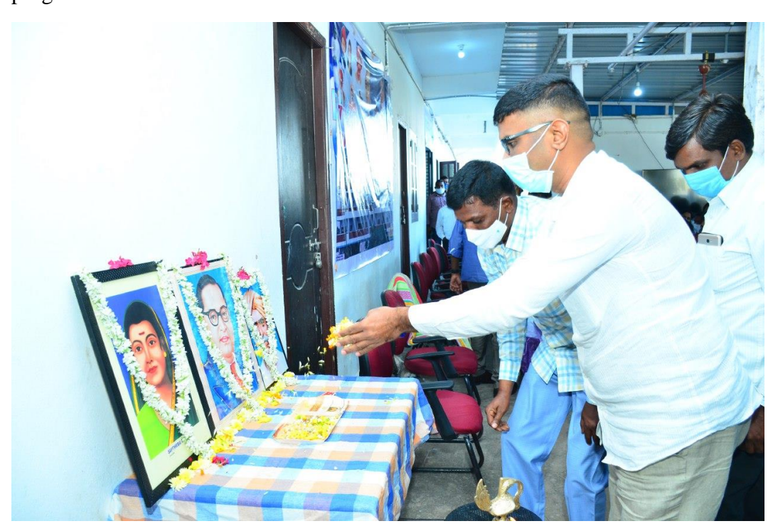
SavithriBai Phule Jayanthi on 3.1.2021

In view of this occasion, on 03.01.2021 TSWRDCW,. The Joint Secretary attended the programme.