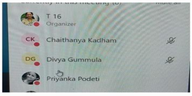
Life Skill program for students through Online in 2021